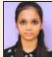
Diskha B.A. II Sem III - 80.25%