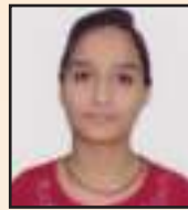
Tisha B.A. III Sem V - 75.40%