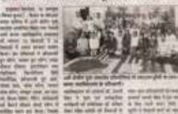
युवा महोत्सव : आर्य कन्या महाविद्यालय के युवा प्रतिस्पर्धाओं में रनर अप ट्रॉफी पर किया कब्जा।