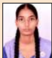
Isha B.A. II Sem III - 79.39%