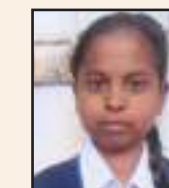
Tannu BCA - II Sem III - 82.50%