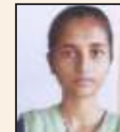
Maniti M.Com. - II Sem-III - 80.1% Sem-IV - 76.8%