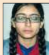
Chesta BCA - III Sem V - 79.17%