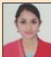
Isha B.Sc. III Sem V - 84.30%