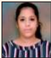
Gungun B.A. I Sem I - 75%