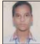
Aarzo B.Sc. II Sem III - 75.95%