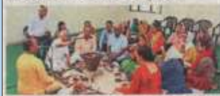
शुभारंभ कार्यक्रम : आर्य कन्या महाविद्यालय, बहालवायु महाविद्यालय में आयोजित हवन का शुभारंभ करके नये सत्र के उद्घाटन का कार्यक्रम संपन्न हुआ। इस अवसर में प्राचार्याजी की अध्यक्षता में प्रमुख अतिथि उपस्थित थे।