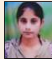
Rytham B.Sc. (FD) - III Sem V - 75.10% Sem VI - 81.50%