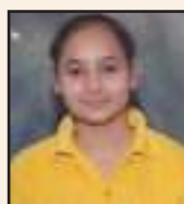
Raman B.A. III Sem V - 76.90%