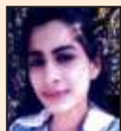
Tannu B.A. II Sem III - 77.35%