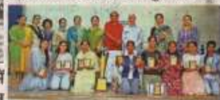
युवा महोत्सव : आर्य कन्या महाविद्यालय में युवा महोत्सव में रनर अप ट्रॉफी लाने पर आर्य कन्या महाविद्यालय में खुशी की लहर।