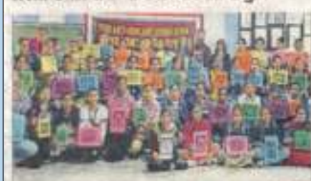
शिक्षक सक्षमता : आर्य कन्या महाविद्यालय के विभिन्न स्तरों में शिक्षण कार्य के लिए कार्यशाला आयोजित की।