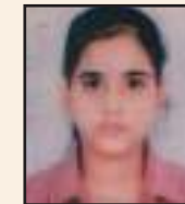
Ekta B.Sc. II Sem III - 80%