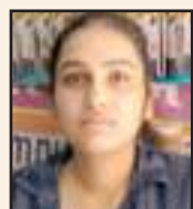
Rouble B.Sc. II Sem III - 76.76%