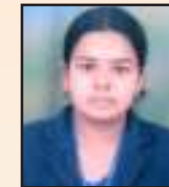
Venu M.Sc. Maths - II Sem-III - 84.1%