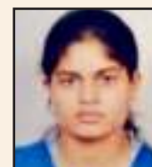
Soldier B.Sc. III Sem V - 77.80%